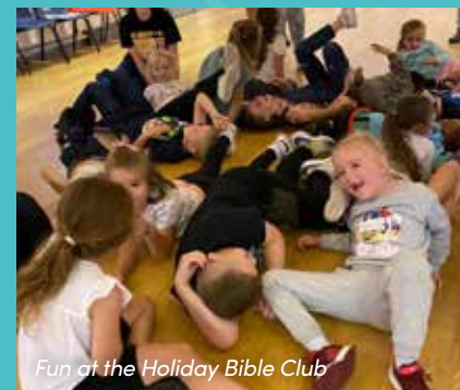
Fun at the Holiday Bible Club

Pray for him as he juggles work with his studies to become a Diocesan Evangelist.