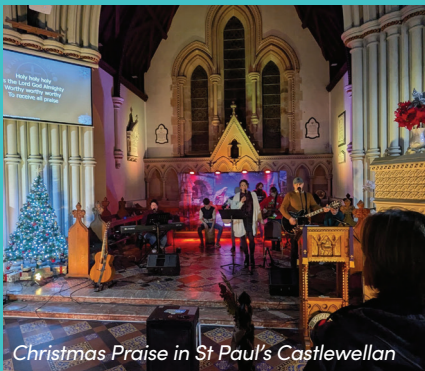
Christmas Praise in St Paul's Castlewellan