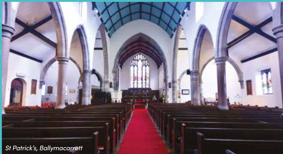
St Patrick's, Ballymacarrett