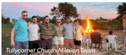
Tullycarnet Church Mission Team

The team was involved in delivering a summer camp for street children, English classes, devotionals, Bible studies, sharing testimony, carrying out house visits, offering prayer ministry, and speaking in the local churches. As the leader of the church community, it was deeply encouraging to