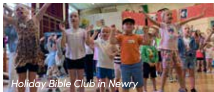
Holiday Bible Club in Newry

From 29 July to 2 August, Newry Centre of Mission, along with some other local churches came together for a week of mission. Our purpose was to spread the message of the hope, love, and freedom found in Jesus with the local community here in Newry. Through various prayer and evangelistic initiatives, we reached out to those in the community with little or no connection to church.