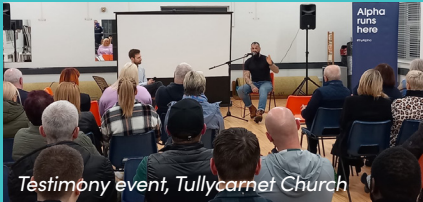
Testimony event, Tullycarnet Church

For a long time, we have really wanted to develop intercessory prayer at Tullycarnet Church. We recently appointed a coordinator for this and now host monthly prayer gatherings where we intercede for our Church, the local community, the nation, and the nations. Prayer at these gatherings is often creative and like a 24-7 Prayer Room.