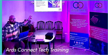
Ards Connect Tech Training

PRAY That we would continue to build connections so that we can best serve newcomers and that God would mobilise volunteers across the diocese; for opportunities to meet with newcomers and the heart to listen and serve them; for those we have already met, that we would be able support and care for them at their point of need; for those who live in a new fear created by the Rwanda Bill; pray that God would guide my steps as we develop the work of the Suitcase Project.