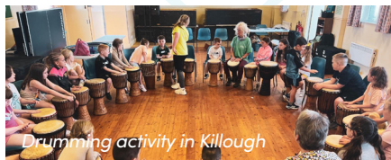
Drumming activity in Killough

At Killough Youth & Children's Outreach, prayer is always central to every session that we deliver. Romans 12:12 says, "Rejoice in hope, be patient in tribulation, be constant in prayer," and this verse has become foundational for us as a team.