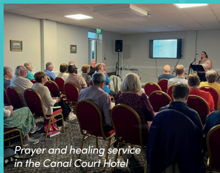
Prayer and healing service in the Canal Court Hotel

In preparation for establishing a new worshipping community in the city of Newry in partnership with the ministry of St Mary's and St Patrick's parish churches,