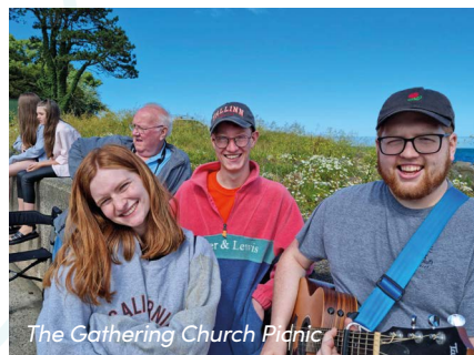
The Gathering Church Picnic

In late July we had our Community BBQ at the church and this was followed a week later by our Church Picnic when we took two minibuses of locals to Carnfunnock Country Park. We had two fabulous days with glorious weather but for me the highlight of the summer was a new believer from our latest Alpha Course declaring her commitment to Jesus before friends and family at our picnic.