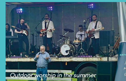
Outdoor worship in the summer

The group is a safe place where people can speak openly and honestly without judgement. There are no taboo areas and no such thing as a stupid question.