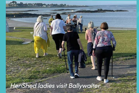
HenShed ladies visit Ballywalter