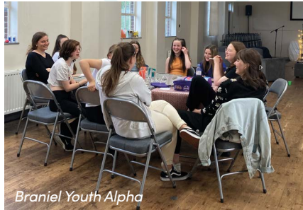
Braniel Youth Alpha

At Braniel Community Church we have a vision to share the gospel with the 4989 people who live in the area within the next two years and have concentrated our efforts on reaching into the community with various events and ministries.